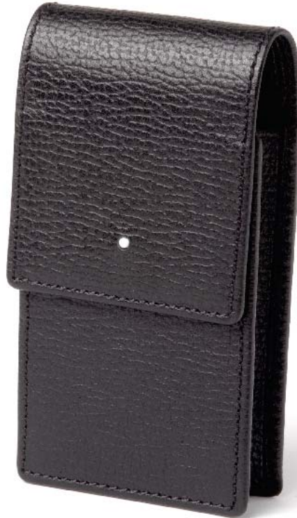
PA7519 Slim Size