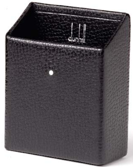
PA7520 King Size Slip Cover