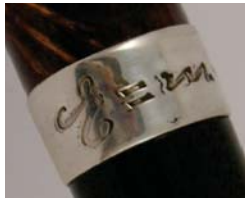
close up of band decoration